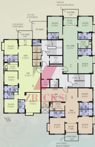
Flats: 1st to 21st floor